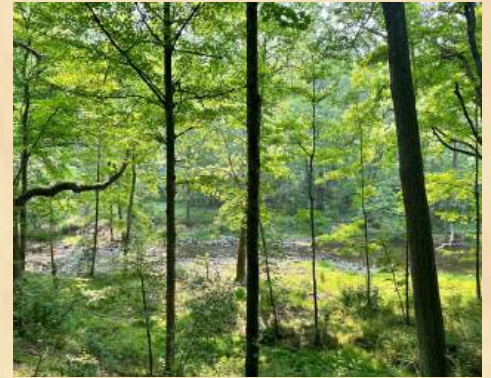
Springfield Twp, $399,000

Listed by Carol C. Dorey Real Estate, Inc.