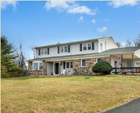
Durham Twp, $880,000