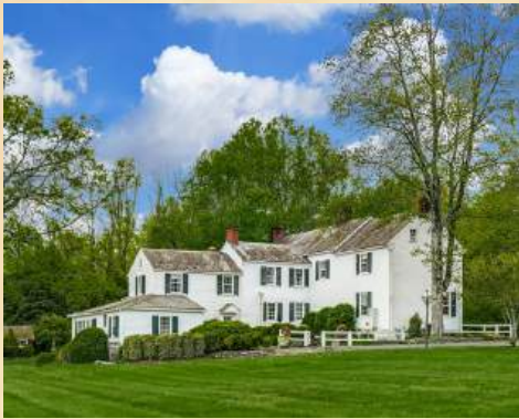
Bridgeton Twp, $1,525,000

Listed by Carol C. Dorey Real Estate, Inc.