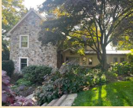
Upper Saucon Twp, $1,050,000 Sold by Carol C. Dorey Real Estate, Inc.