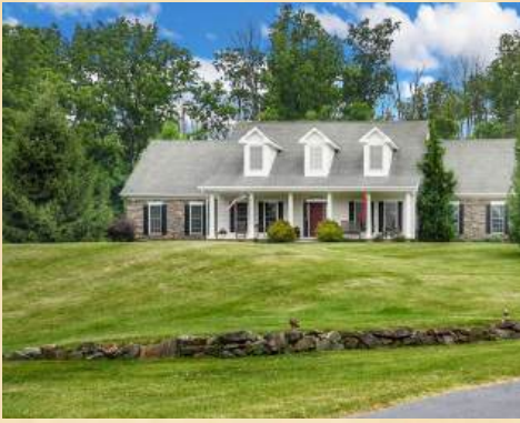
Haycock Twp, $900,000

Listed by Carol C. Dorey Real Estate, Inc.