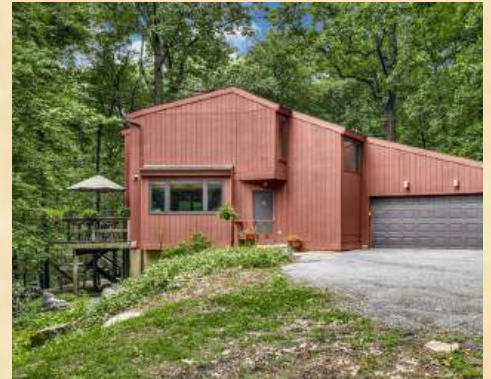
Lower Saucon Twp, $535,000

Listed & Sold by Carol C. Dorey Real Estate, Inc.