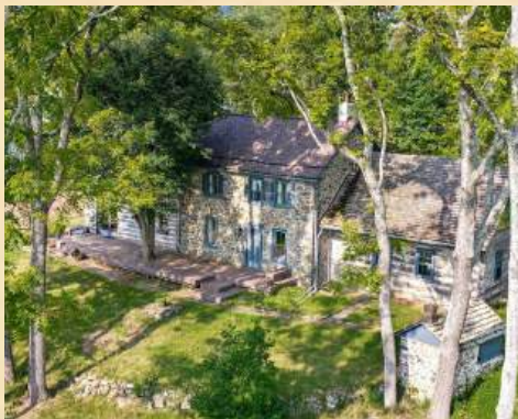
Richland Twp, $750,000

Listed by Carol C. Dorey Real Estate, Inc.