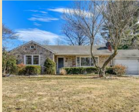
City of Bethlehem, $321,000

Listed by Carol C. Dorey Real Estate, Inc.