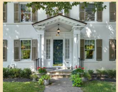
City of Bethlehem, $1,075,000

Sold by Carol C. Dorey Real Estate, Inc.