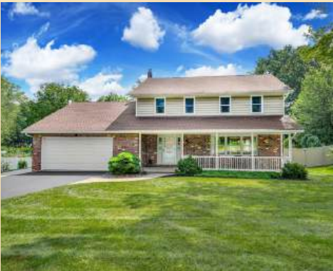
City of Bethlehem, $500,000

Listed by Carol C. Dorey Real Estate, Inc.