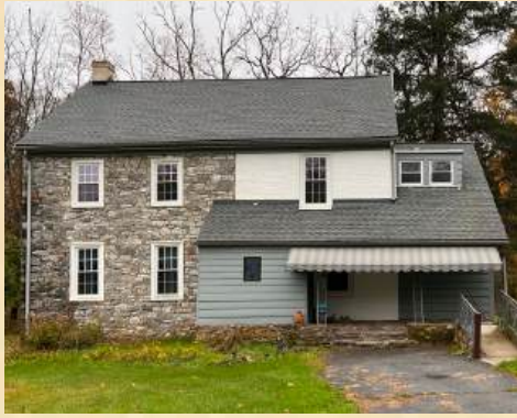
Lower Macungie Twp, $351,200

Sold by Carol C. Dorey Real Estate, Inc.