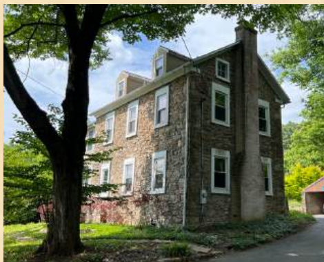
Springfield Twp, $720,000

Listed by Carol C. Dorey Real Estate, Inc.