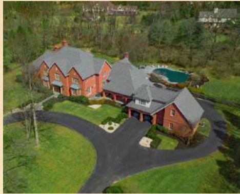
Lower Saucon Twp, $1,484,000

Listed by Carol C. Dorey Real Estate, Inc.