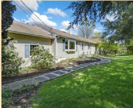
Nockamixon Twp, $537,000

Listed by Carol C. Dorey Real Estate, Inc.