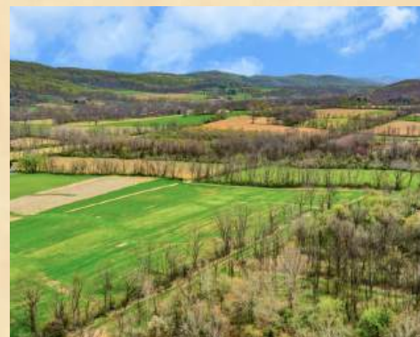
Springfield Twp, $710,000

Sold by Carol C. Dorey Real Estate, Inc.