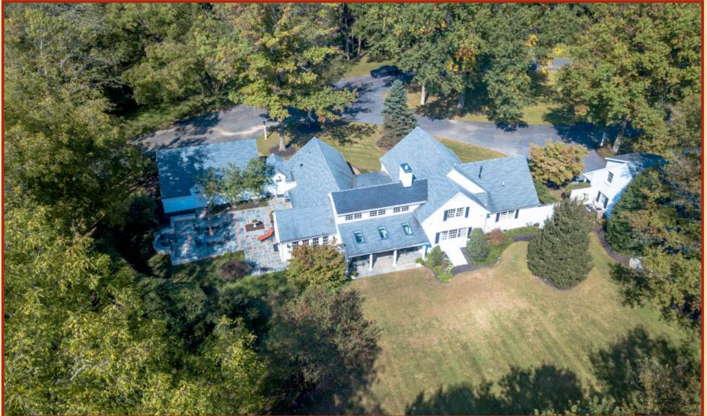
Lower Saucon Twp, $3,500,000 Listed & Sold by Carol C. Dorey Real Estate, Inc.

The following pages feature some of the area's finest homes and farms that were listed and/or sold by Carol C. Dorey Real Estate, Inc. during 2023. We are a boutique, non-franchised office and have built a solid reputation for more than 45 years by only representing properties in the top of the marketplace - those priced above $300,000.