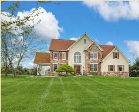
Lower Saucon Twp, $837,000

Listed & Sold by Carol C. Dorey Real Estate, Inc.