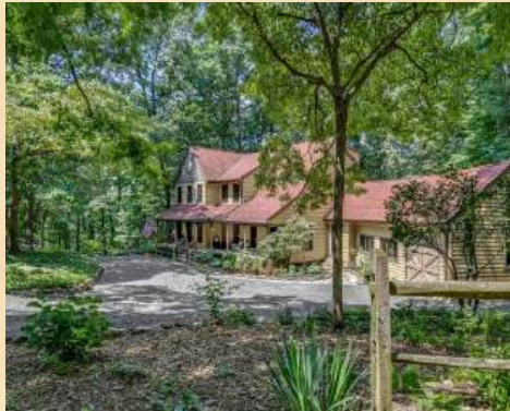
Springfield Twp, $875,000

Listed by Carol C. Dorey Real Estate, Inc.