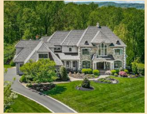
Lower Saucon Twp, $1,625,873

Listed & Sold by Carol C. Dorey Real Estate, Inc.