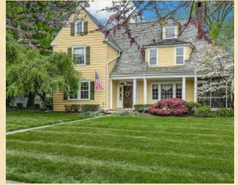
City of Bethlehem, $550,000

Sold by Carol C. Dorey Real Estate, Inc.