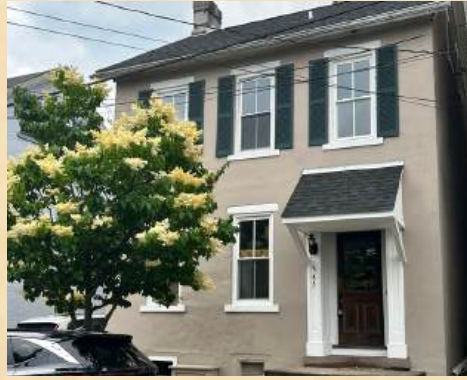
City of Bethlehem, $350,000

Sold by Carol C. Dorey Real Estate, Inc.