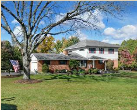
Lower Saucon Twp, $410,000

Listed & Sold by Carol C. Dorey Real Estate, Inc.