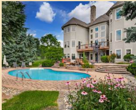
North Whitehall Twp, $1,399,000

Listed & Sold by Carol C. Dorey Real Estate, Inc.