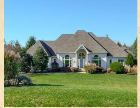
Williams Twp, $910,200 Listed by Carol C. Dorey Real Estate, Inc.