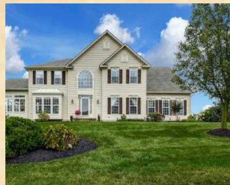
Washington Twp, $660,000

Listed by Carol C. Dorey Real Estate, Inc.