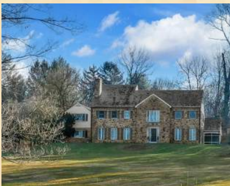
Lower Saucon Twp, $1,229,000

Sold by Carol C. Dorey Real Estate, Inc.