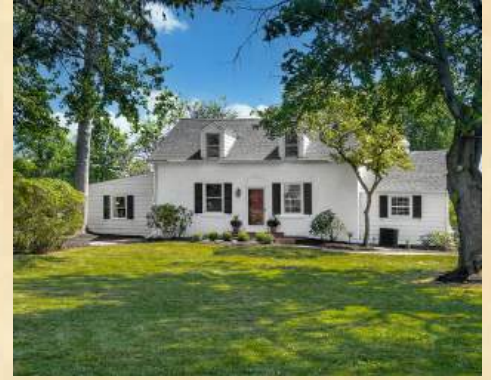
Bethlehem Twp, $412,000

Listed by Carol C. Dorey Real Estate, Inc.