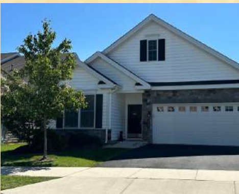
Upper Saucon Twp, $485,000

Sold by Carol C. Dorey Real Estate, Inc.