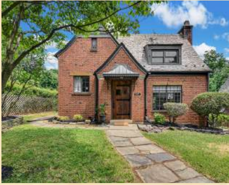
City of Easton, $425,000

Listed & Sold by Carol C. Dorey Real Estate, Inc.