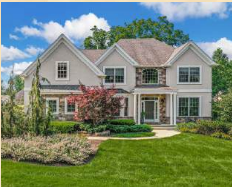
Upper Saucon Twp, $905,000 Listed & Sold by Carol C. Dorey Real Estate, Inc.