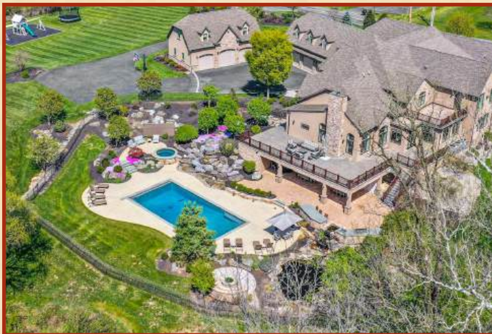
East Allen Twp, $3,300,000 Listed by Carol C. Dorey Real Estate, Inc.