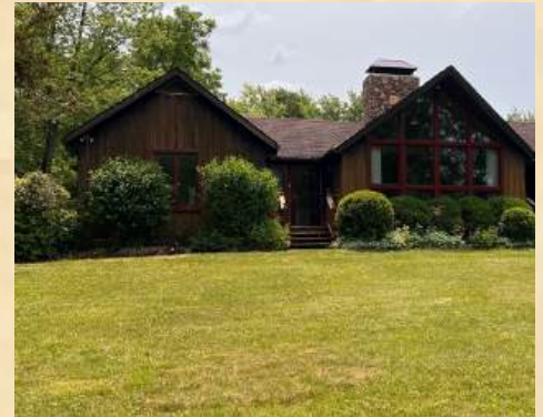
Plumstead Twp, $805,000

Sold by Carol C. Dorey Real Estate, Inc.