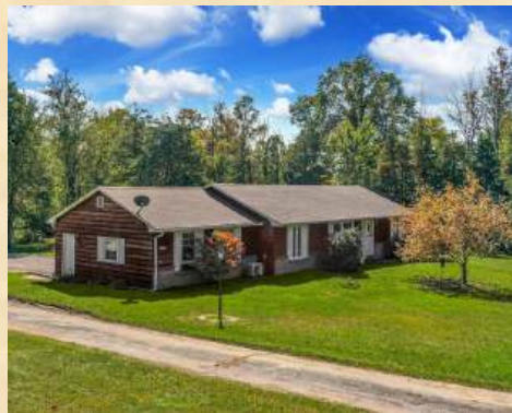
Springfield Twp, $366,200

Sold by Carol C. Dorey Real Estate, Inc.