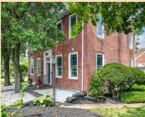
Towamencin Twp, $675,000

Listed by Carol C. Dorey Real Estate, Inc.