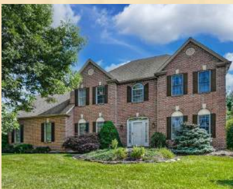
Lower Saucon Twp, $630,000

Listed by Carol C. Dorey Real Estate, Inc.