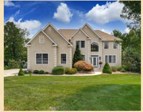
Upper Saucon Twp, $881,000

Sold by Carol C. Dorey Real Estate, Inc.