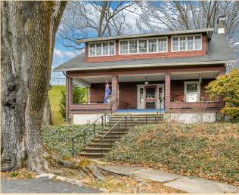
City of Easton, $575,000

Listed & Sold by Carol C. Dorey Real Estate, Inc.