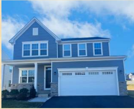
North Catasauqua Boro, $550,000

Listed & Sold by Carol C. Dorey Real Estate, Inc.