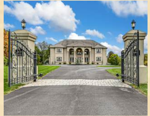
Lower Saucon Twp, $1,461,790

Listed by Carol C. Dorey Real Estate, Inc.