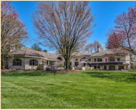
Bethlehem Twp, $1,900,000

Listed by Carol C. Dorey Real Estate, Inc.