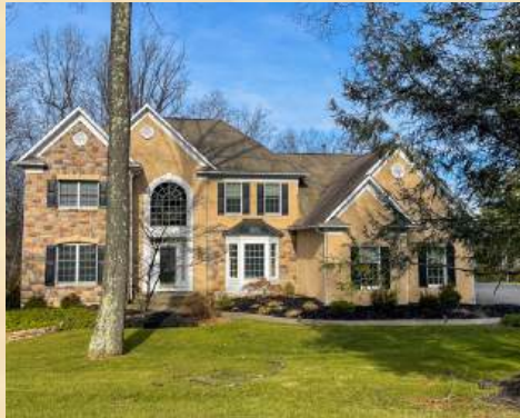
Upper Saucon Twp, $815,000