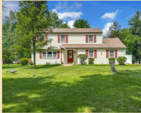
Bedminster Twp, $410,000

Listed by Carol C. Dorey Real Estate, Inc.