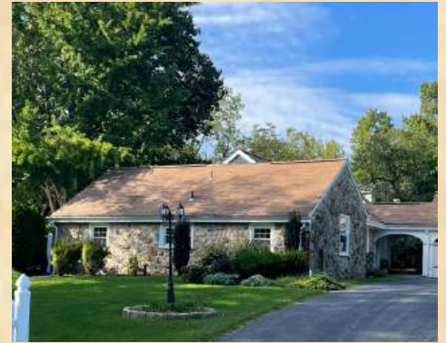
City of Bethlehem, $375,000

Listed by Carol C. Dorey Real Estate, Inc.