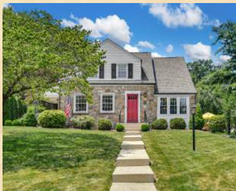
City of Bethlehem, $452,500