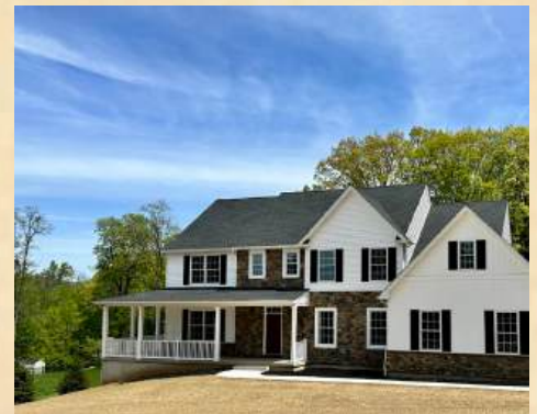
Lower Saucon Twp, $750,000

Listed by Carol C. Dorey Real Estate, Inc.