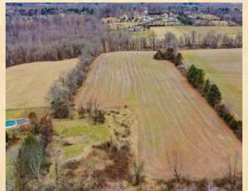
Springfield Twp, $355,000

Listed by Carol C. Dorey Real Estate, Inc.