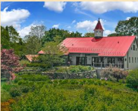
Heidelberg Twp, $777,625

Sold by Carol C. Dorey Real Estate, Inc.