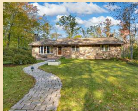
East Rockhill Twp, $600,000

Listed & Sold by Carol C. Dorey Real Estate, Inc.