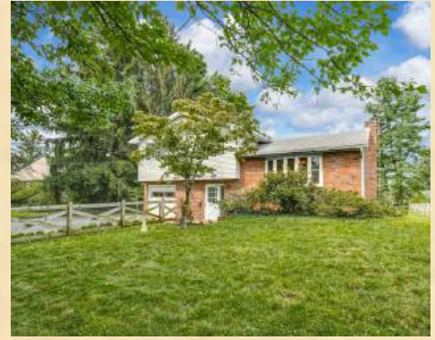
Springfield Twp, $350,000

Listed & Sold by Carol C. Dorey Real Estate, Inc.