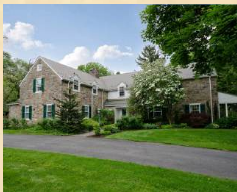
City of Bethlehem, $1,182,000