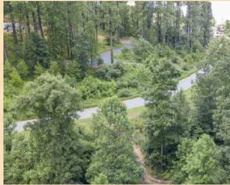
Upper Saucon Twp, $390,000

Listed by Carol C. Dorey Real Estate, Inc.