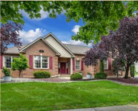
Lower Macungie Twp, $546,100

Listed & Sold by Carol C. Dorey Real Estate, Inc.