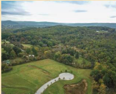
Salisbury Twp, $495,000

Listed by Carol C. Dorey Real Estate, Inc.