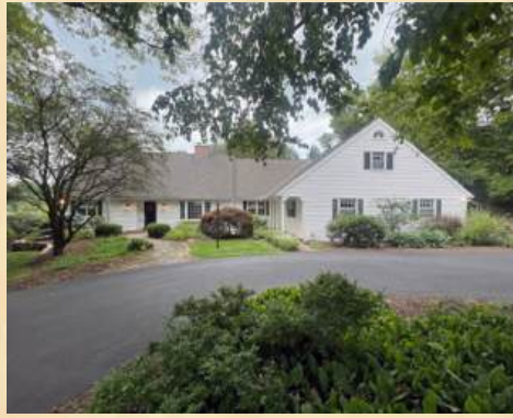
Upper Milford Twp, $890,000

Listed by Carol C. Dorey Real Estate, Inc.