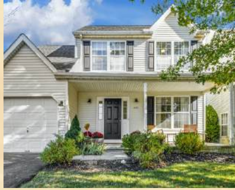
Milford Twp, $420,000

Listed & Sold by Carol C. Dorey Real Estate, Inc.