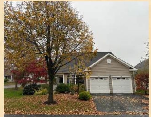
Lower Macungie Twp, $494,900

Listed & Sold by Carol C. Dorey Real Estate, Inc.