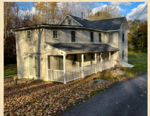
Bridgeton Twp, $450,000

Listed by Carol C. Dorey Real Estate, Inc.