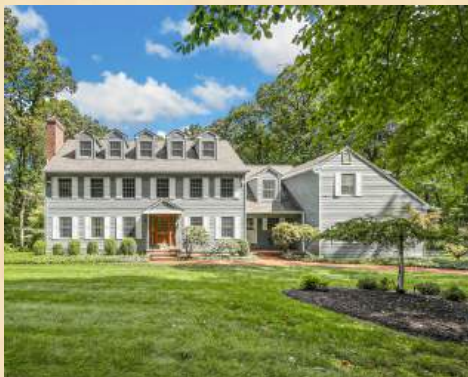
Springfield Twp, $759,000

Listed by Carol C. Dorey Real Estate, Inc.