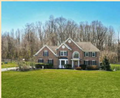
Lower Saucon Twp, $735,000

Listed by Carol C. Dorey Real Estate, Inc.