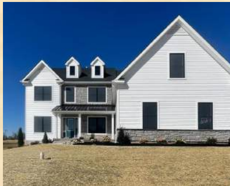
Upper Saucon Twp, $900,945 Sold by Carol C. Dorey Real Estate, Inc.