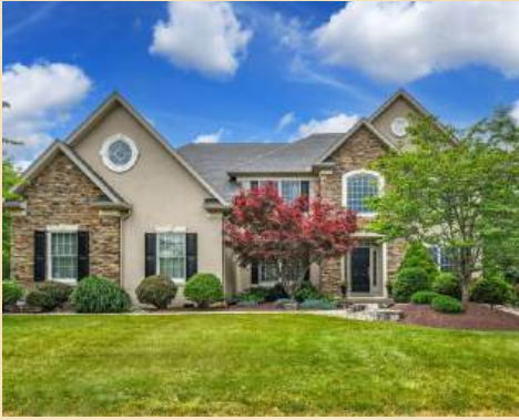
Upper Saucon Twp, $943,333 Listed by Carol C. Dorey Real Estate, Inc.