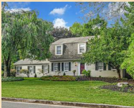
Buckingham Twp, $665,000

Listed by Carol C. Dorey Real Estate, Inc.