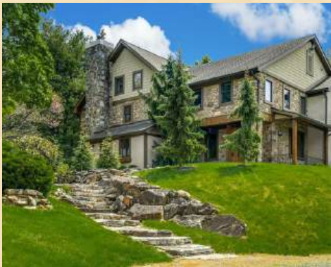
Upper Saucon Twp, $1,450,000

Listed & Sold by Carol C. Dorey Real Estate, Inc.