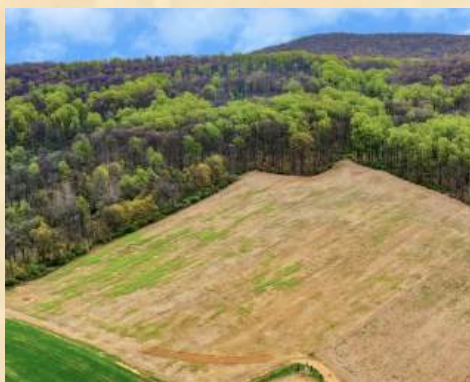
Springfield Twp, $610,000