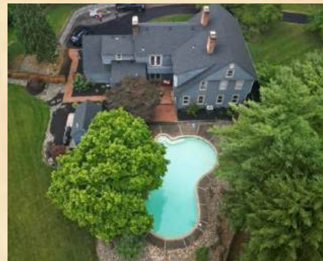
Lower Macungie Twp, $735,000

Listed by Carol C. Dorey Real Estate, Inc.