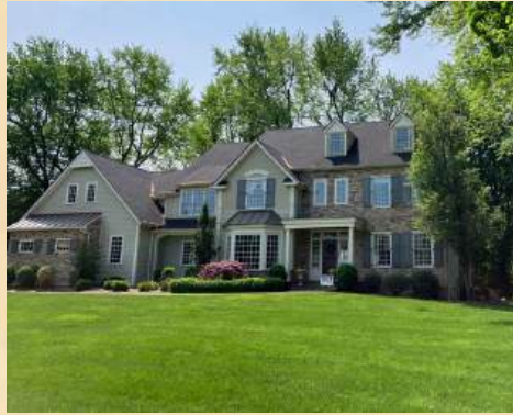
Salisbury Twp, $975,000 Sold by Carol C. Dorey Real Estate, Inc.