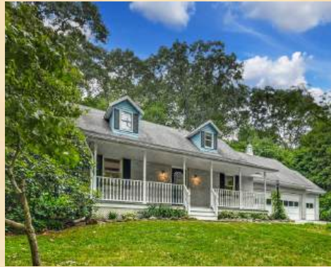
Salisbury Twp, $385,000

Listed by Carol C. Dorey Real Estate, Inc.