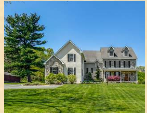
Lower Saucon Twp, $865,000

Listed by Carol C. Dorey Real Estate, Inc.