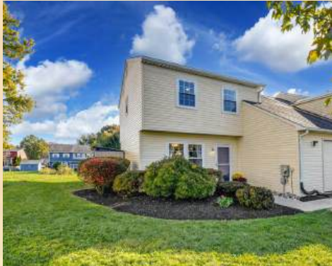
Lower Salford Twp, $335,000

Listed by Carol C. Dorey Real Estate, Inc.