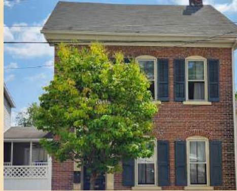
City of Bethlehem, $300,000

Sold by Carol C. Dorey Real Estate, Inc.