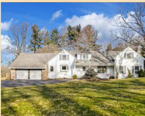
Lower Saucon Twp, $725,000

Sold by Carol C. Dorey Real Estate, Inc.