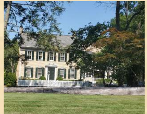
City of Bethlehem, $1,270,000

Listed & Sold by Carol C. Dorey Real Estate, Inc.