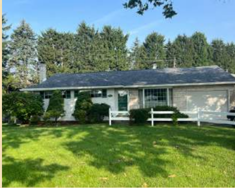
City of Bethlehem, $305,000

Sold by Carol C. Dorey Real Estate, Inc.