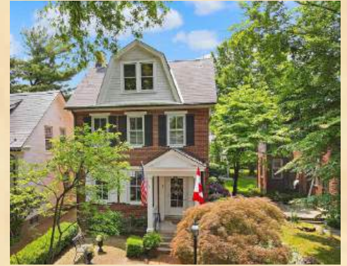
City of Bethlehem, $975,000 Sold by Carol C. Dorey Real Estate, Inc.