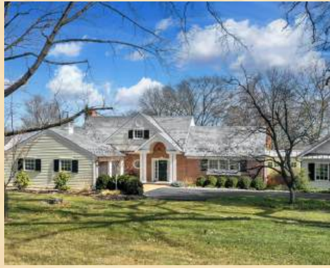
Lower Saucon Twp, $1,810,000

Listed by Carol C. Dorey Real Estate, Inc.