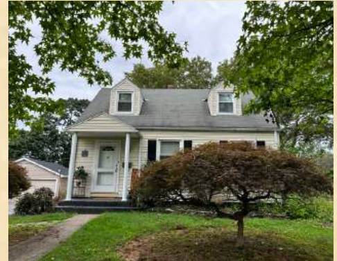
Hellertown Boro, $317,000