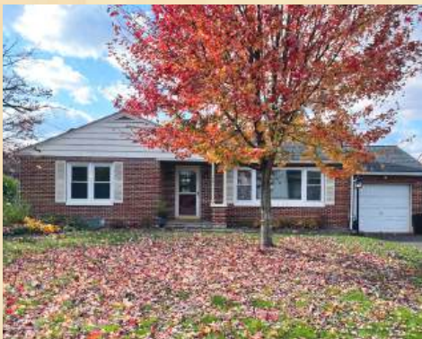
Riegelsville Boro, $374,900

Sold by Carol C. Dorey Real Estate, Inc.