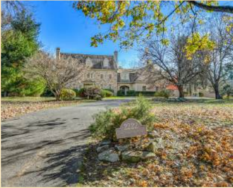
Salisbury Twp, $1,000,000 Listed & Sold by Carol C. Dorey Real Estate, Inc.